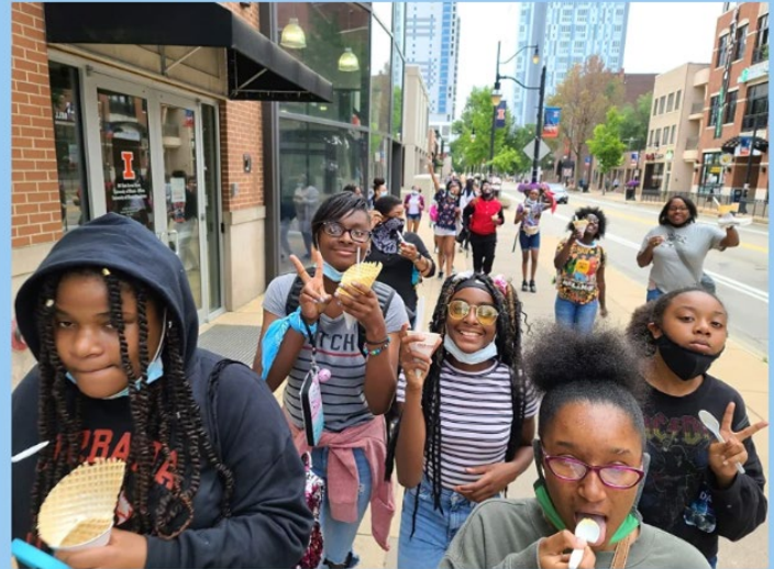
Girls to Life Senior girls visited the University of Illinois Campus. We ended with a stop at Cold Stones Creamery!

Outside of home and school, children need community support to help them grow and learn. The Well Experience provides support all year round, with summer, after school, and day programming for children to support children from birth to 18 years of age. Our programs are filled with cultural, academic, recreational, social-emotional, and therapeutic activities designed with underserved and marginalized children in our community in mind. Reach out to us at The Well Experience if you have questions about the Well Kids Program!