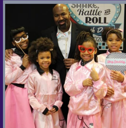
Princess Night Out